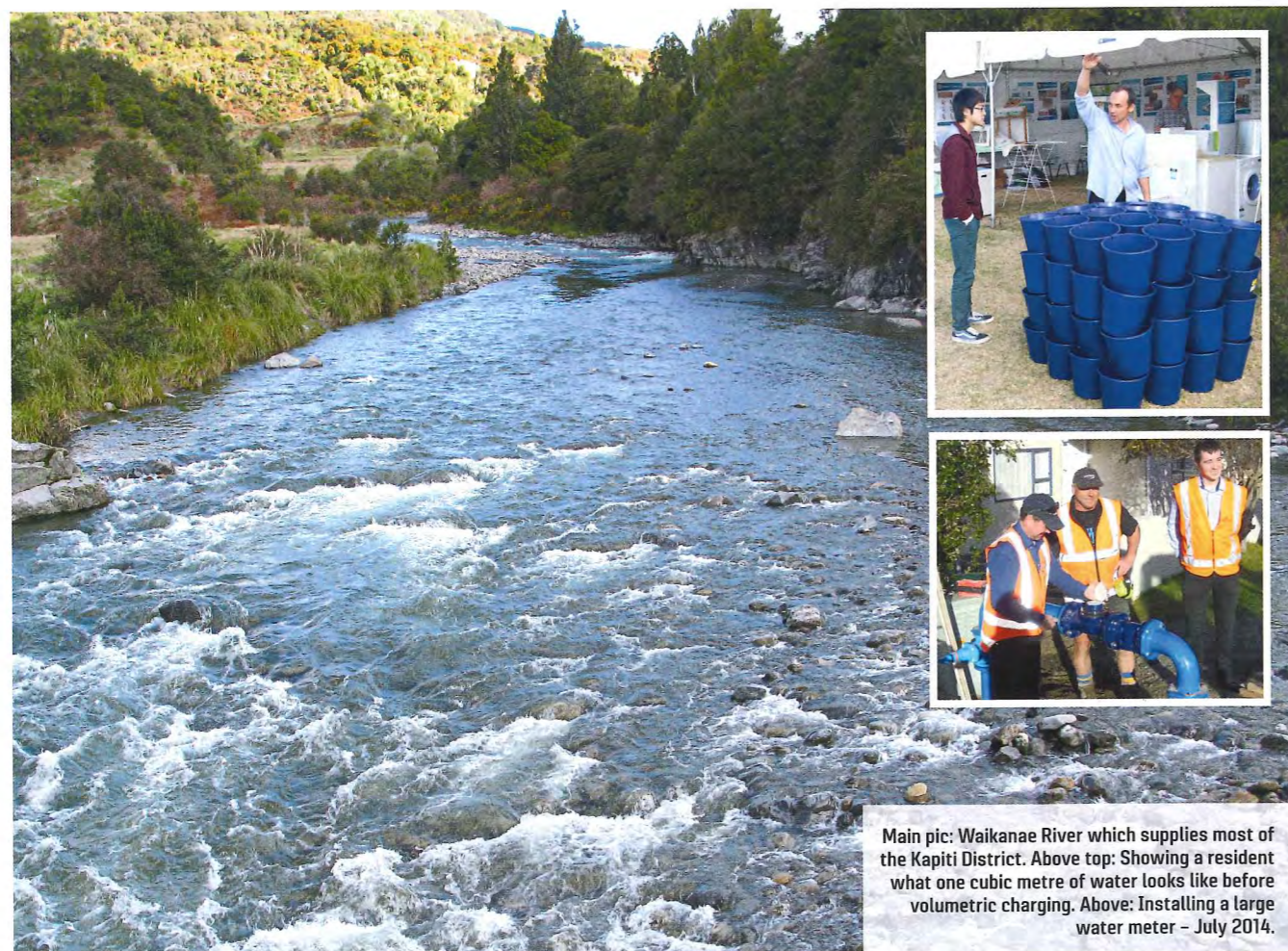
Main pic: Waikanae River which supplies most of the Kapiti District. Above top: Showing a resident what one cubic metre of water looks like before volumetric charging. Above: Installing a large water meter – July 2014.